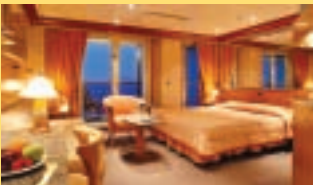
MS S GS

LISBONA DECK Oceanview with veranda; 2 lower beds convert to queen LISBONA/CARACAS/VIGO/NAPOLI/BARCELONA DECKS Oceanview with veranda; 2 lower beds convert to queen