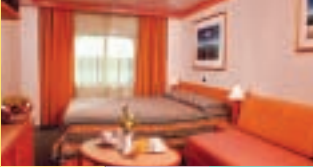
6A 6 7

RIO DE JANEIRO/LISBONA/NAPOLI DECKS Inside; 1 lower bed and 1 upper bed for Caribbean sailings; available as a single for non-Caribbean sailings RIO DE JANEIRO/MIAMI/LISBONA/CARACAS/VIGO/NAPOLI/ BARCELONA DECKS Inside; 2 lower beds convert to queen