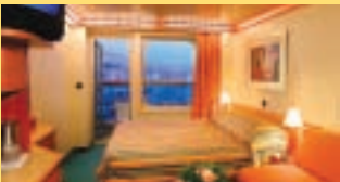
8A 8 9 10

RIO DE JANEIRO/MIAMI DECKS Oceanview; 1 lower bed and 1 upper bed for Caribbean sailings; available as a single for non-Caribbean sailings RIO DE JANEIRO/MIAMI/LISBONA/CARACAS/NAPOLI/BARCELONA/CANNES DECKS Oceanview; 2 lower beds convert to queen